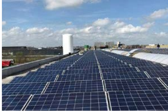
Drachten, The Netherlands