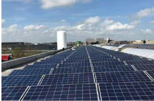
Drachten, The Netherlands